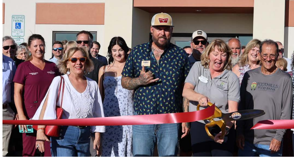
Town of Cave Creek

As we prepare for what may be another year of change, high grocery prices, and growing unemployment, we reflect on the milestones made possible in 2025 because of your gifts. Together, we will continue working toward building a thriving community where no one goes hungry.