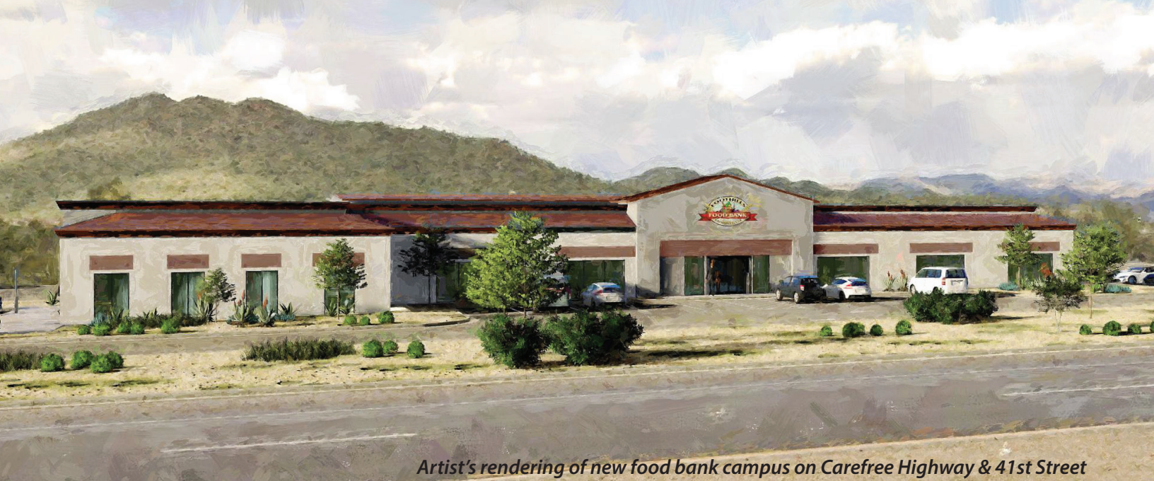
Artist's rendering of new food bank campus on Carefree Highway & 41st Street

“Our Mission is to provide food, referral information and financial assistance to individuals and families in need within our service area.”